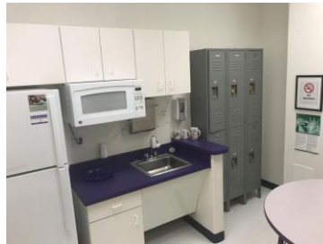
In-room plumbing & appliances